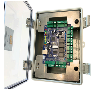
BOARD + HOUSING